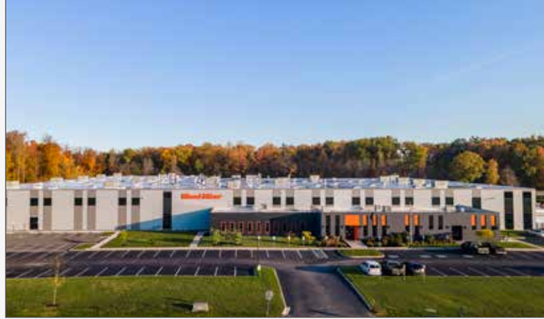
North America manufacturing facility in Batesville, IN.