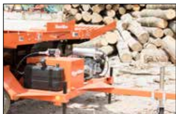
COMPLETELY PORTABLE FEATURES A 3,500 LB TORSION AXLE, STABILIZING HITCH, SAFETY CHAINS AND LED LIGHTS FOR TOWING.