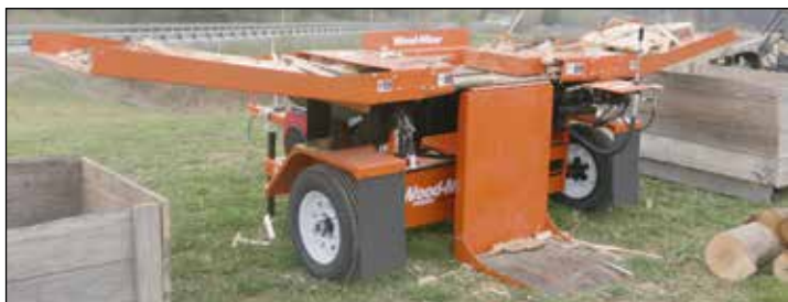
SIMPLE SHIPPING AND ASSEMBLY Shipped on a single 88" x 60" pallet and assembled in minutes with only 7 bolts to secure before operation.