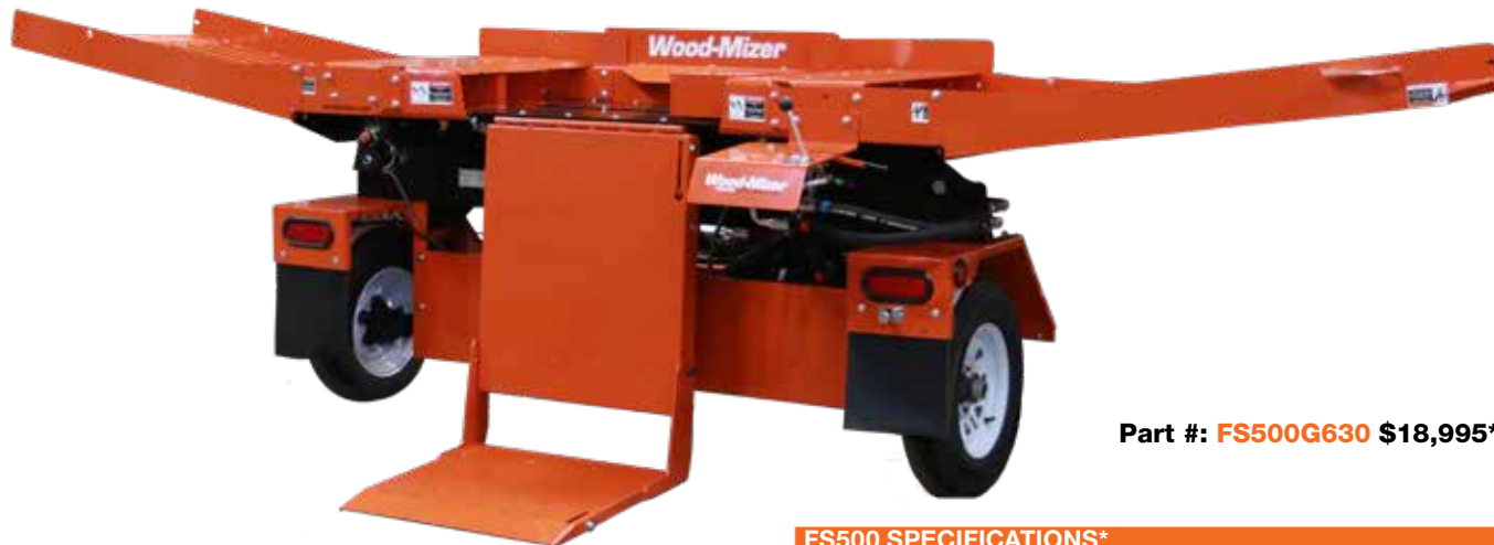
Part #: FS500G630 $18,995*