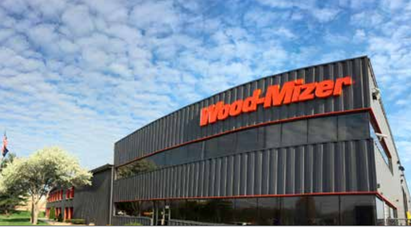
Global Headquarters and blades manufacturing facility in Indianapolis, IN.