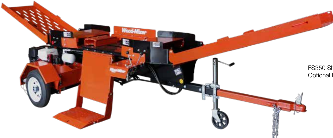
FS350 Shown with Optional Log Lift