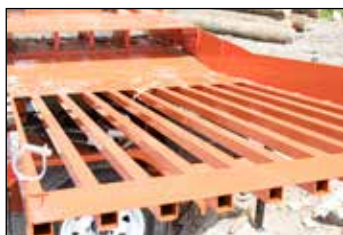
STANDARD WITH TWIN FLUTED WING TRAYS TO SEPARATE THE DEBRIS. (SHOWN WITH OPTIONAL 4-WAY WEDGE)